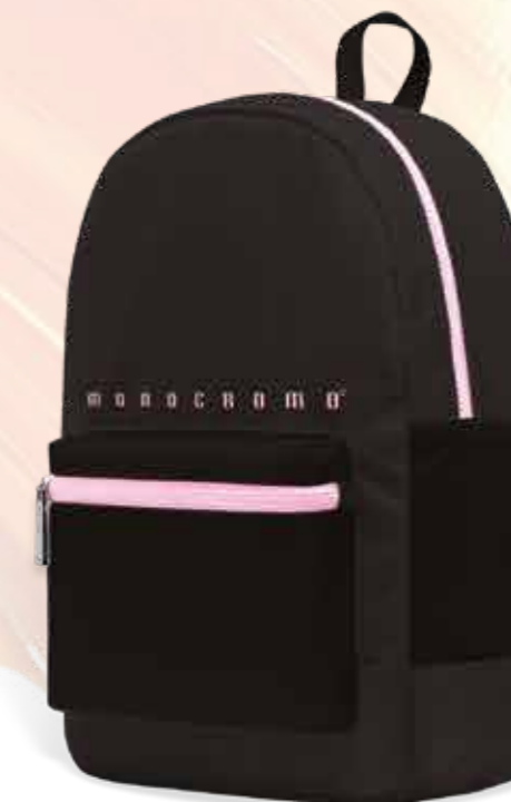
● Ref. 474528

• 20 L • CM 45x31x18 Ref. 472528 Ean: 8059606168227