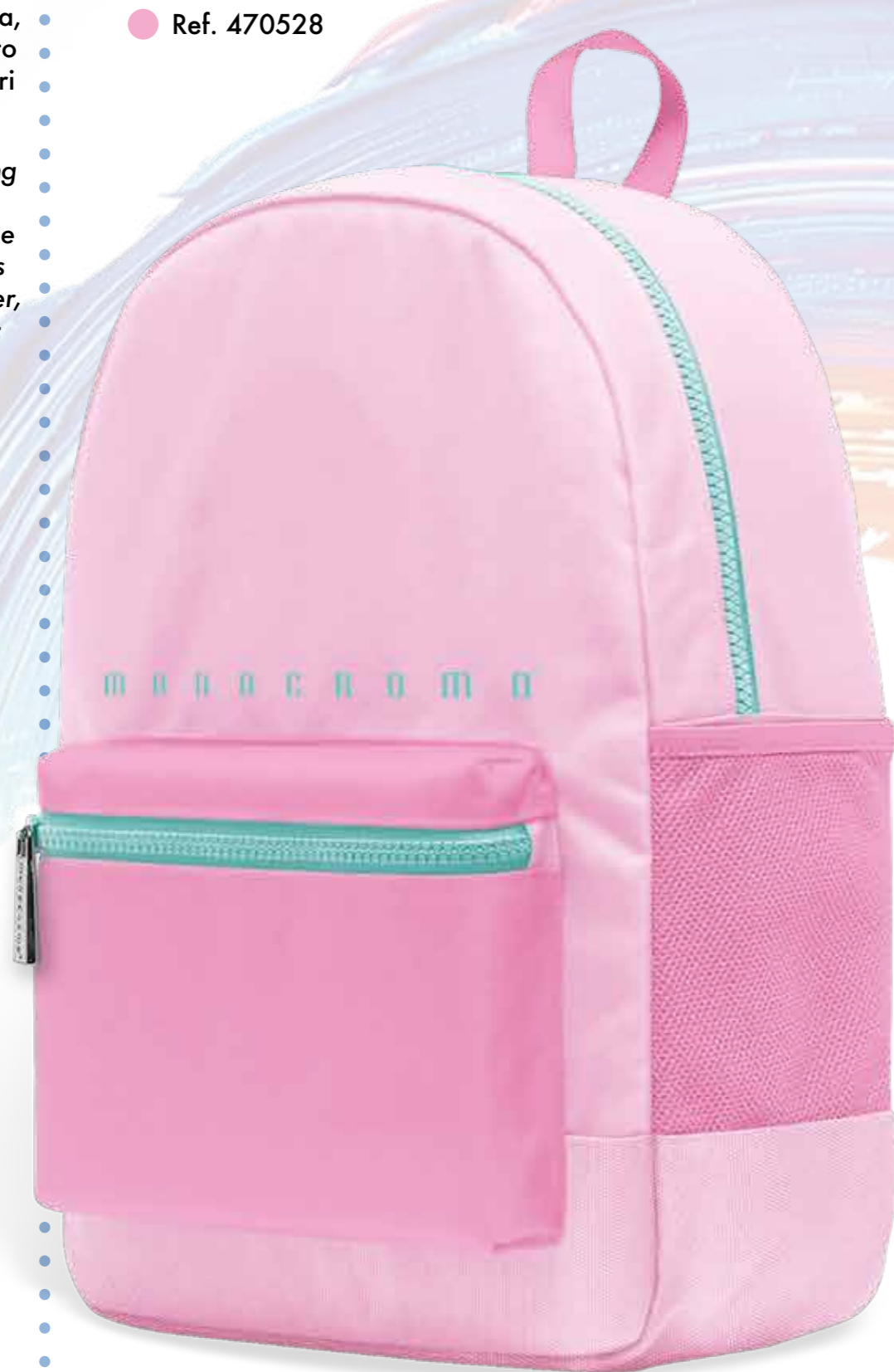
● Ref. 470528

• 20 L • CM 45x31x18 Ref. 470528 Ean: 8059606168234