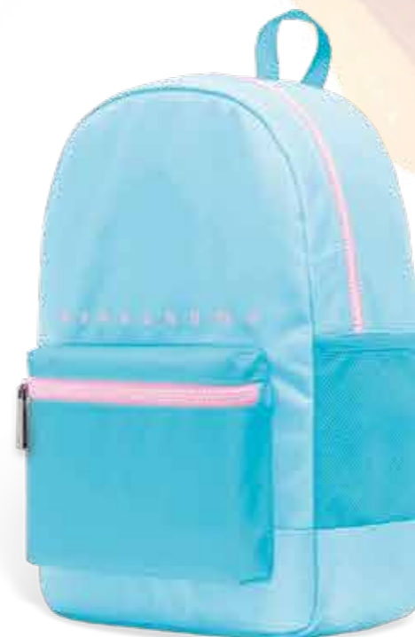
● Ref. 471528

• 20 L • CM 45x31x18 Ref. 474528 Ean: 8059606168203