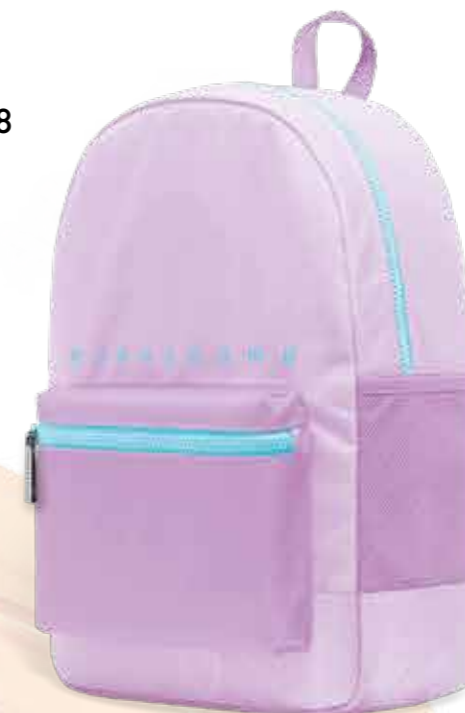
● Ref. 473528