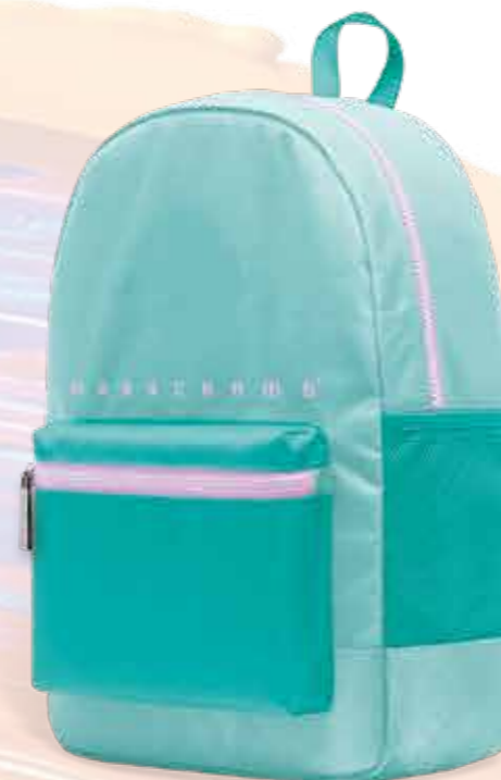
● Ref. 472528

• 20 L • CM 45x31x18 Ref. 473528 Ean: 8059606168241